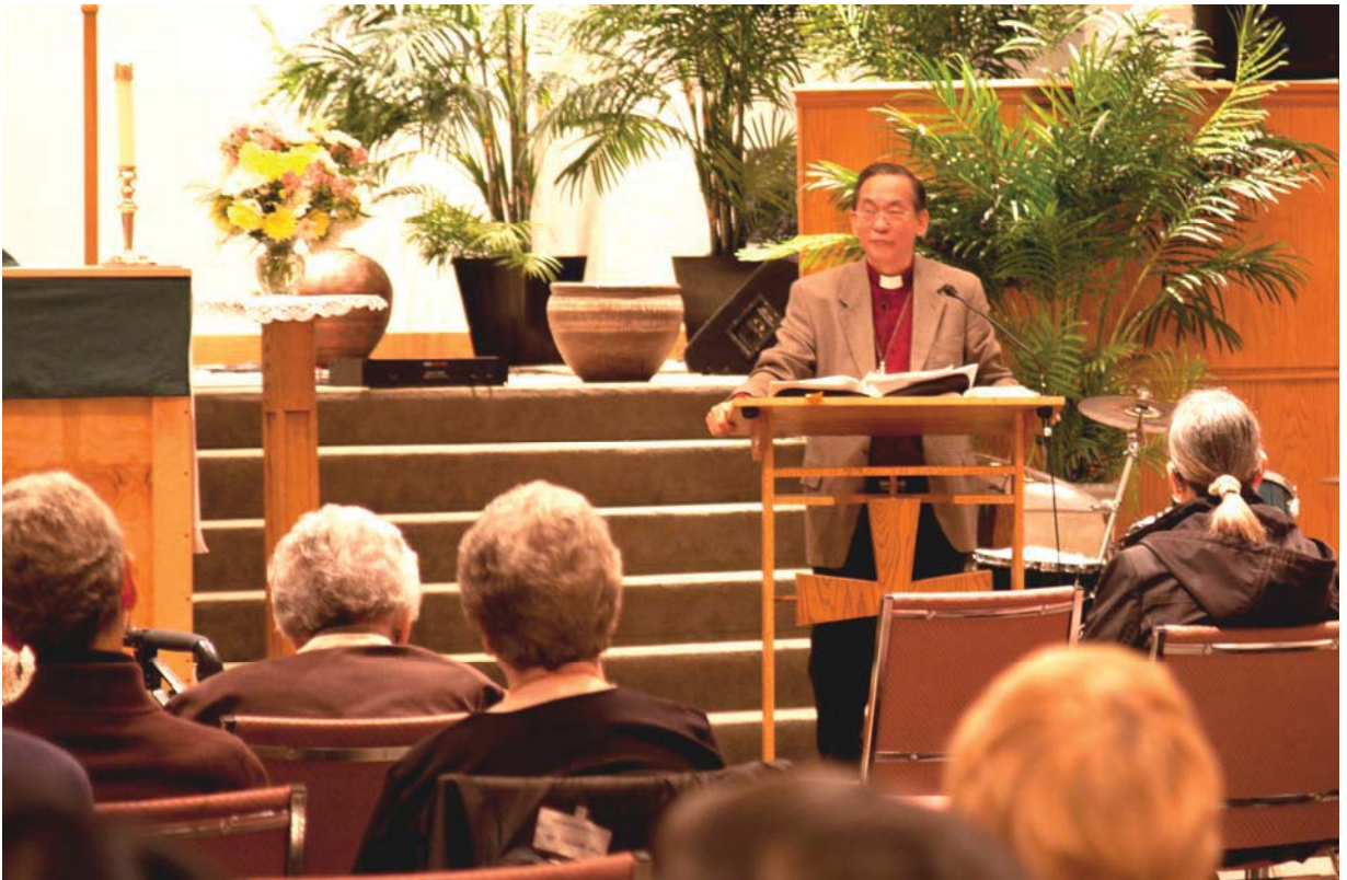
Archbishop Yong Ping Chung preaches on September 18 th , 2011