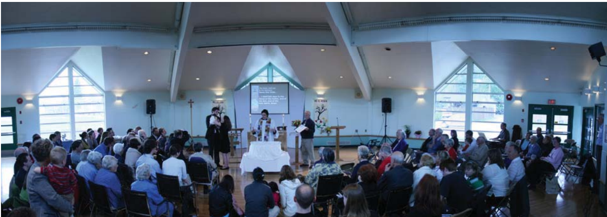
Baptism at St. Timothy's NVRC 2009