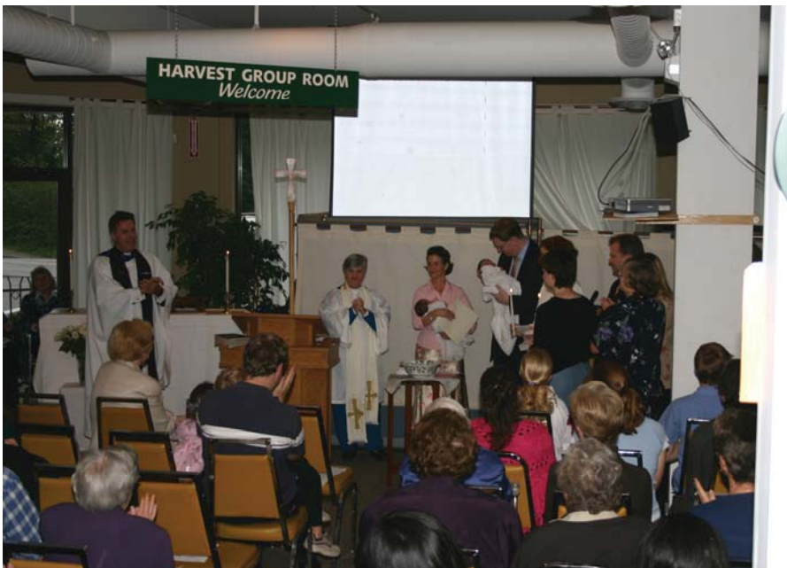
Baptism at St Timothy's (Harvest Project) 2004