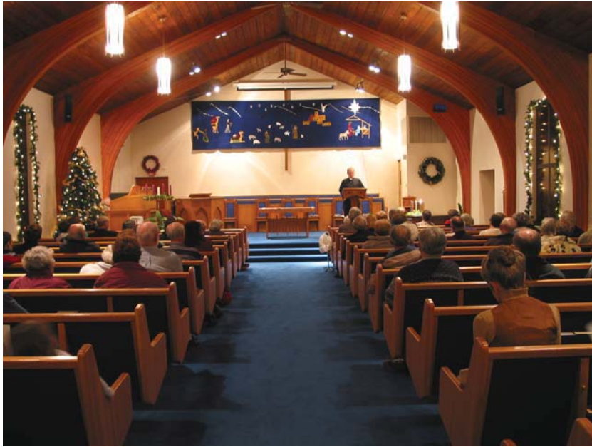
Monday Evening Services at St Andrew and St Stephen's Presbyterian Church